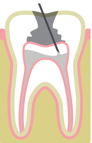
Filling the canals